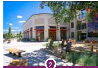
GARAGE RETAIL BY IMWALLE/RODRIGUES Orange Theory Fitness, Coffee Guys Opened December 2016