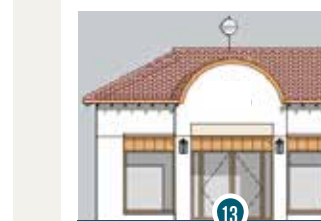
RETAIL BY LONESTAR 5000 Sq. Ft. with Outdoor Patio Opening 2018